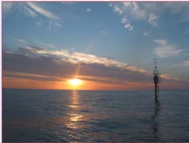
ODAS ITALIA 1 Buoy